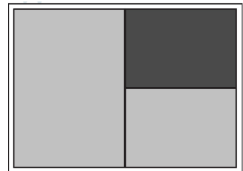
Quarter Page - 2.84 x 3.5 $300.00